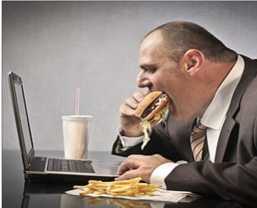
Figure 2. Obesity and metabolic syndrome induced of computer overuse

Computer and internet overuses increase sedentary time and inactivity which impact on body weight as well as body mass index (BMI) at which can cause overweight and obesity conditions in different individual [12]. Computational technological changes will raise obesity and associated illness. Long term sitting following long-term computer use increase appetites and reduce the desire of being active so that the fat layer accumulate in body in part in the abdomen (belly) first and induce different level of obesity (Figure 2). At the subsequent time, serious health condition such as cardiovascular and heart diseases, metabolic syndrome, high blood pressures cancers can appear in long – terms [13]. Consequently, additional cost of obesity in different health setting statistically is very high and account for heavy burden on global economic. More importantly, morbidity and mortality associated with obesity are enhancing per second per year [14].