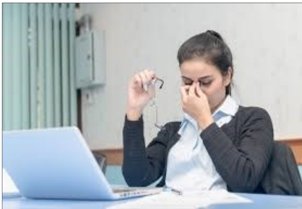
Figure 3. Computer vision syndrome