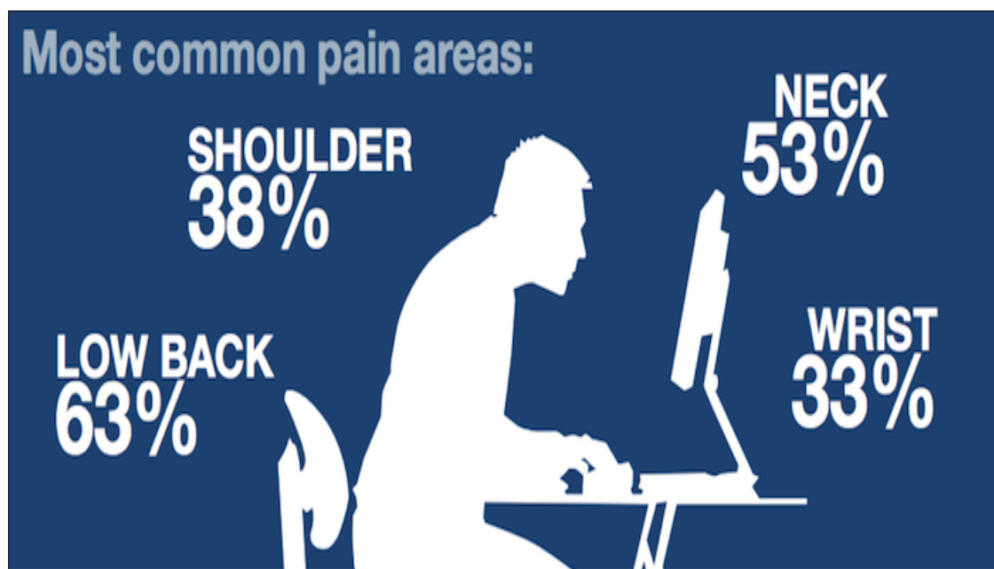
Figure 1. The most common pain areas in human body induced from compute overuse

It is common focusing on computer screen long period of time that can cause unnatural postural alignments at different point of body segments. Neck, shoulders, low back and wrists are the most frequent points that can suffer computer overuse related pains such strain (Figure 1). Subsequently postural defect can promote the risks of falls and injuries while locomotion. This is because improper sitting or standing and poor alignments can affect muscle contractions and the way the body move [10]. Prolong musculoskeletal pains and discomforts can create permeant disability which reduce the quality of lifespan and well – being [11].