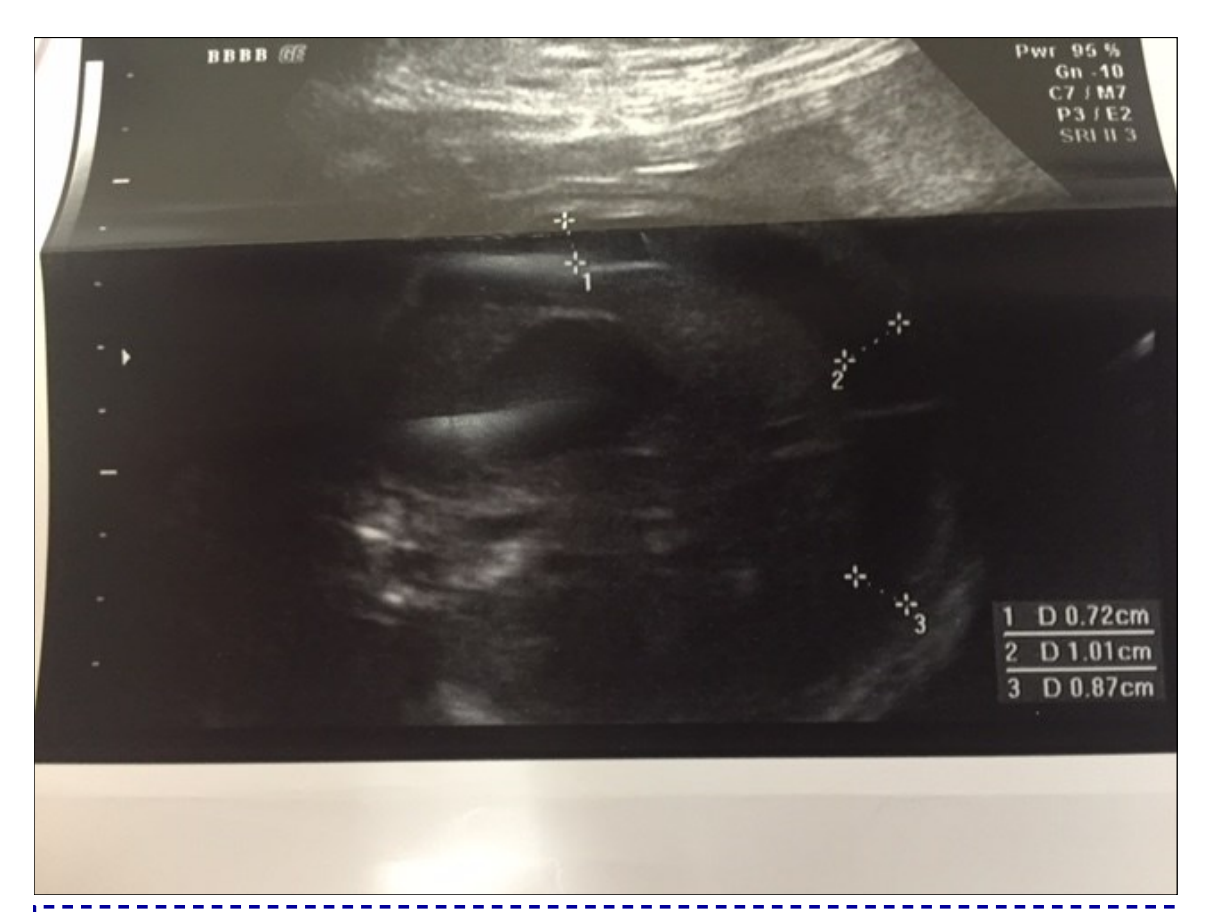
Figure 1. Antenatal Ultrasound demonstrating the guide wire and shunt in position. The thickness of the amniotic fluid is being measured by the markers.